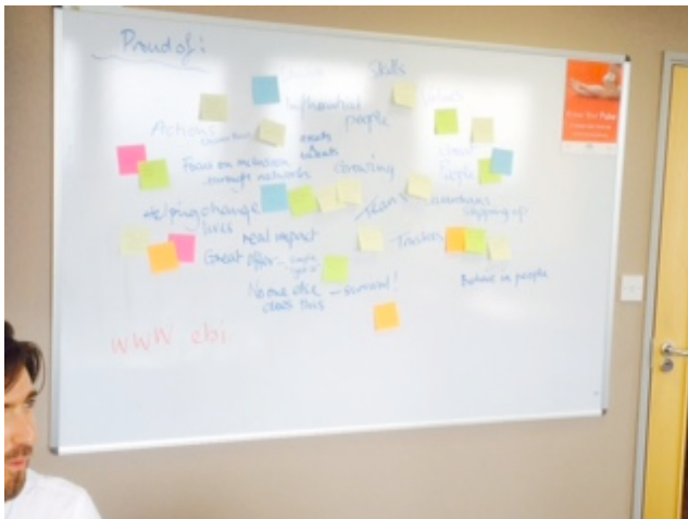
Celebrating our successes -

We think that people are starting to “get” what we do and that we are developing a good reputation for the service we provide with referral agencies and our customers!